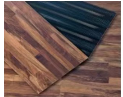
Loose Lay LVT Flooring