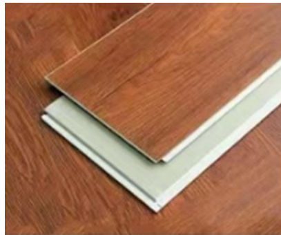
SPC Click Flooring