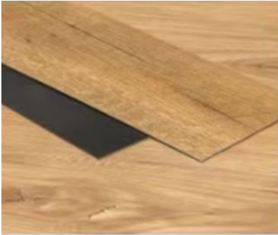
Glue Down/Dry Back LVT Flooring